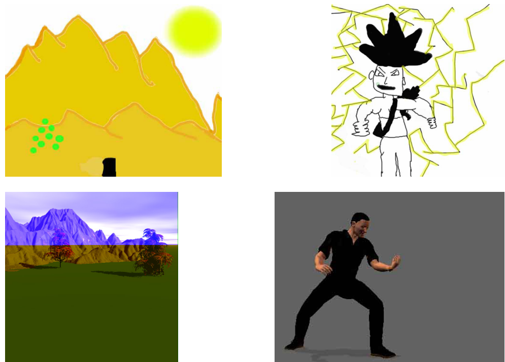
Abb. 3: LOUIS' WORK IN PHOTOSHOP AND BRYCE 3D (Oct. and Nov. 2001).

On the whole, the boys were content with Photoshop when they were drawing objects and writing text. However, when the boys started drawing their characters and landscapes, they were dissatisfied with the simple drawing images they were producing. They wanted their images to appear more realistic and less hand-drawn. Therefore, two 3D packages (Bryce 3D and Poser) were introduced to supplement their work. The boys quickly dismissed their work in Photoshop in favour of the 3D look. Louis, for example, had been fairly successful at drawing a man and a mountain (using Photoshop). But when he repeated those images using the 3D software, not surprisingly, he did not return to his Photoshop work (see figure 3).