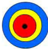
Abb. 5: SCREENSHOT OF SIMPLE GAME, LAWRENCE, MAY 2002.