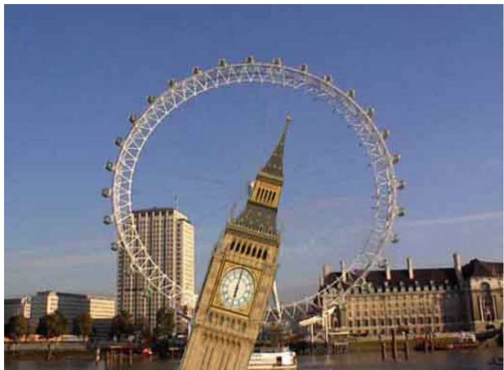
Abb. 4: SCREENSHOT OF BIG BEN COLLAPSING, JAKE, MAY 2002.

After the boys made their posters, using the 3D software and Photoshop, four class sessions were devoted to formal instruction on Flash, a professional animation software package. In these sessions the boys did experimental projects which included scripting interactive elements (using buttons, for example), but in the end these skills were not used as part of their final games projects. The boys also learned „tweening“ which allows for objects to be animated without programming every frame, and they learned frame-by-frame animation. The final projects ended up being animated narrative introductions to the boys' invented computer games. The animation projects were assembled in Flash, and the tutor did most of the work of assembling the projects, due to the complexity of the task. Only one boy, Jake, used Flash independently in his final project (to make images of a newspaper spinning and Big Ben collapsing, see figure 4). Towards the end of the course, Lawrence, who was also able to use Flash independently, was making very rudimentary games in the first half hour of the class before the sessions started (for example, in one of Lawrence's games the player had to try to click on a moving target, see figure 5).