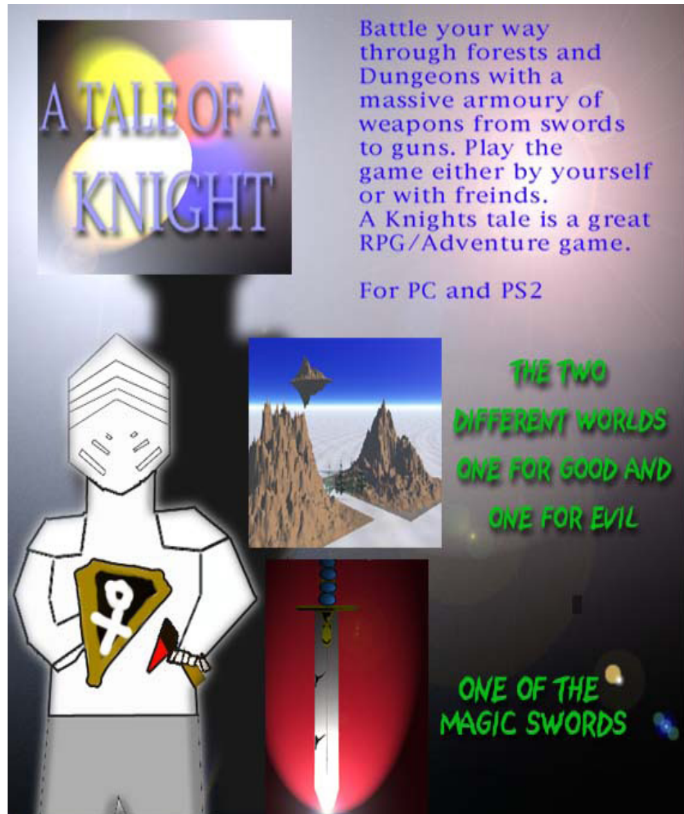
Abb. 1: POSTER MADE IN GAMES CLASS (November 2001).

During the designing of the posters the boys had to consider the concepts covered in the analysis. They chose specific genres of game and thought about what elements constitute a particular genre. For example, the poster in figure 1 advertises a medieval role play game by using particular elements (knight, sword, different worlds), language (1 st person address, descriptive words) and lighting (shadow of the knight, glinting sword). The choices the boys made when making the posters reflect their awareness of elements of gaming and game advertising, thereby making explicit some of the otherwise implicit